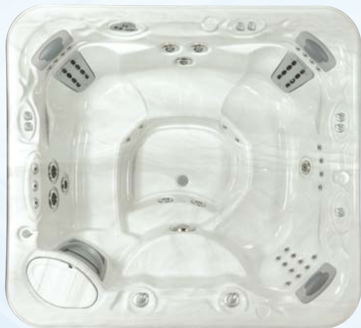
Grandee spa shell shown in Sterling Marble

Two Moto-Massage® DX jets let two people enjoy a terrific back massage at the same time. The BellaFontana® water feature adds to the overall ambiance, with three illuminated arcs of water where color dances.