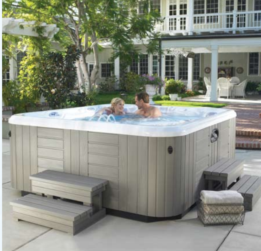
Grandee spa shown with Sterling Marble shell and Coastal Gray cabinet.