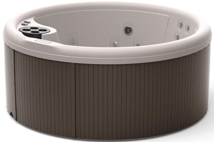
Shown with Dune Shell and Espresso Cabinet