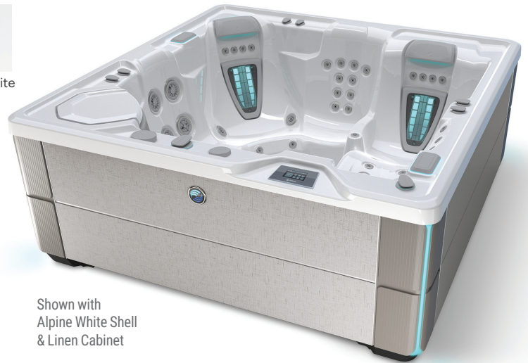
Shown with Alpine White Shell & Linen Cabinet