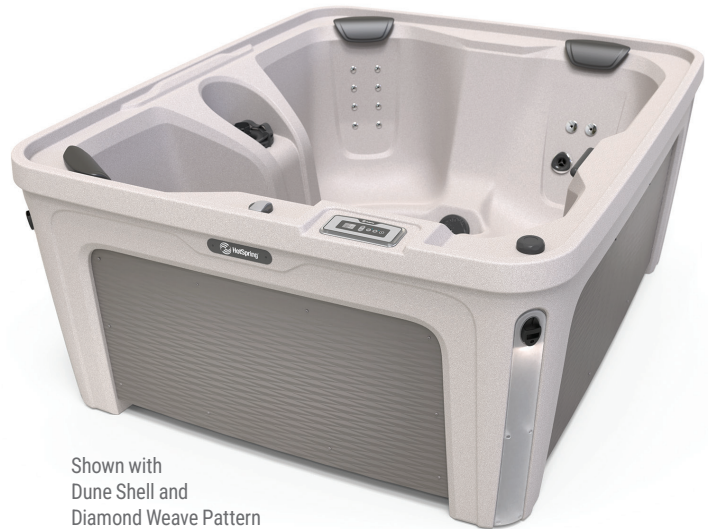
Shown with Dune Shell and Diamond Weave Pattern