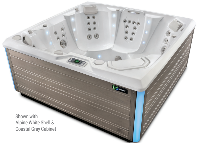
Shown with Alpine White Shell & Coastal Gray Cabinet