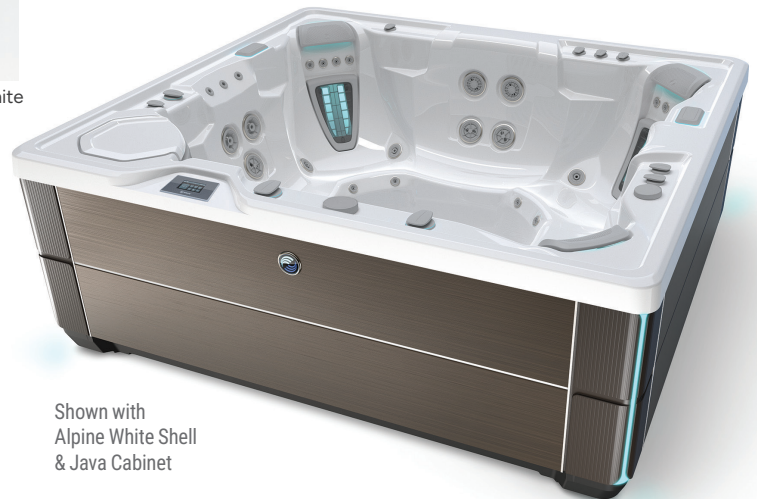
Shown with Alpine White Shell & Java Cabinet