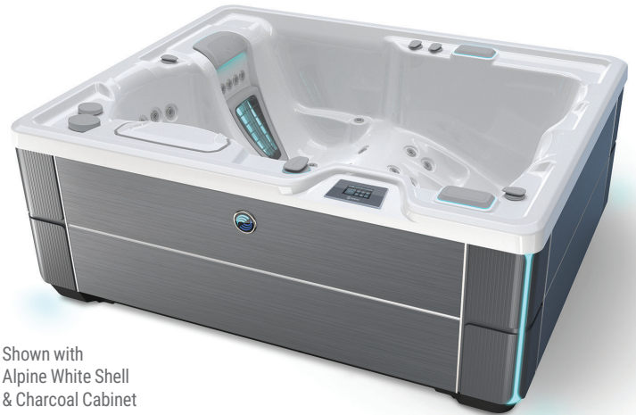
Shown with Alpine White Shell & Charcoal Cabinet