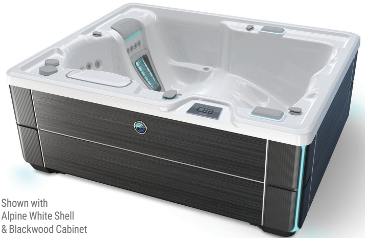
Shown with Alpine White Shell & Blackwood Cabinet