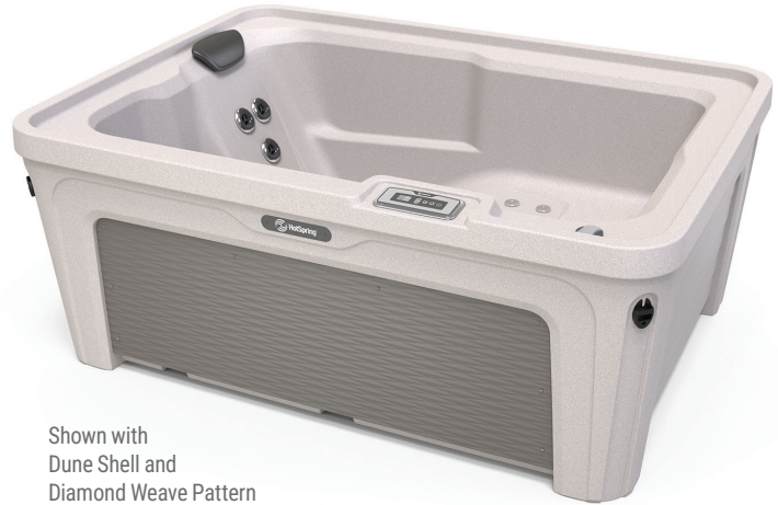
Shown with Dune Shell and Diamond Weave Pattern