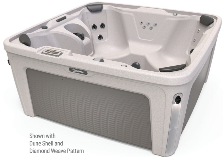
Shown with Dune Shell and Diamond Weave Pattern