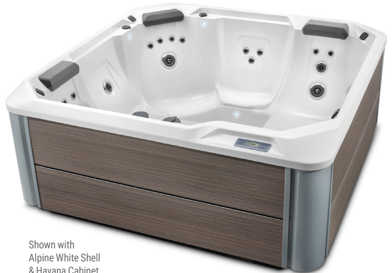
Shown with Alpine White Shell & Havana Cabinet