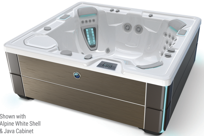
Shown with Alpine White Shell & Java Cabinet