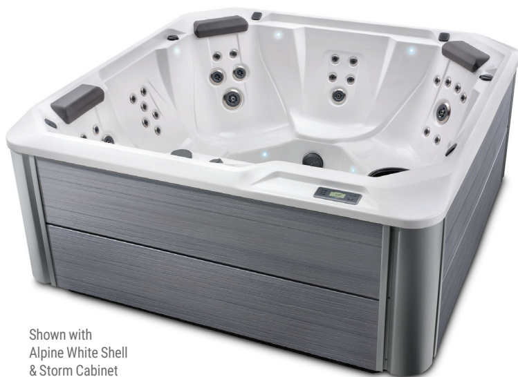
Shown with Alpine White Shell & Storm Cabinet