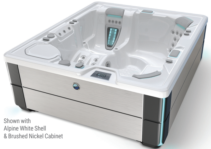
Shown with Alpine White Shell & Brushed Nickel Cabinet