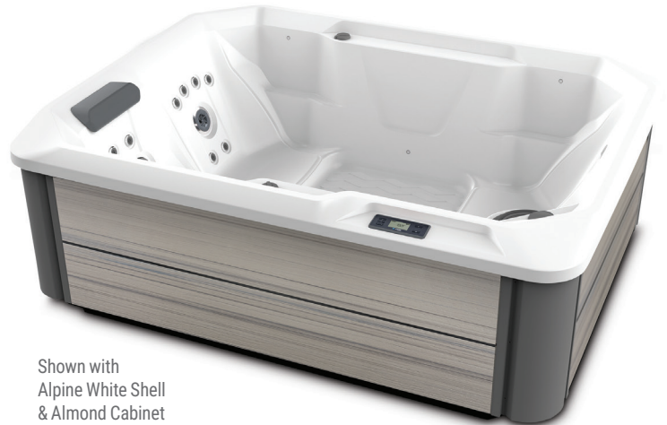
Shown with Alpine White Shell & Almond Cabinet