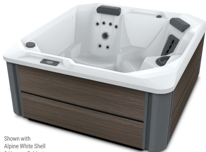
Shown with Alpine White Shell & Havana Cabinet