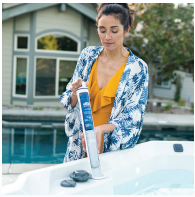
Frog® @ease® In-Line Cartridge Ready