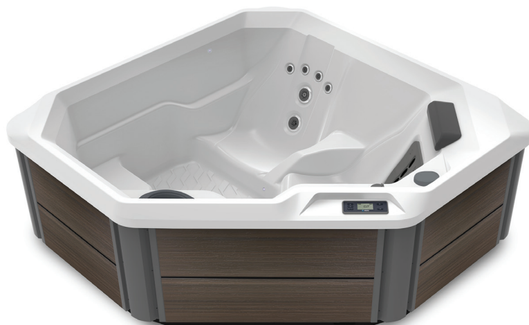
Shown with Alpine White Shell & Havana Cabinet