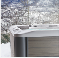
FiberCor® High-Density Insulation