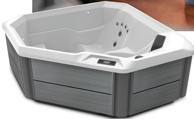
Shown with Alpine White Shell and Storm Cabinet.

People Seating Jets Voltage 2 Seats Open 11 Jets 115 V or 230 V