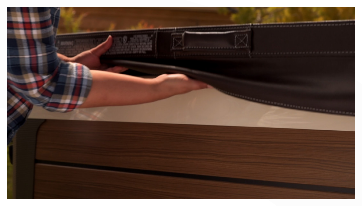
2. Reach between the hot tub and cover to break the seal between them.