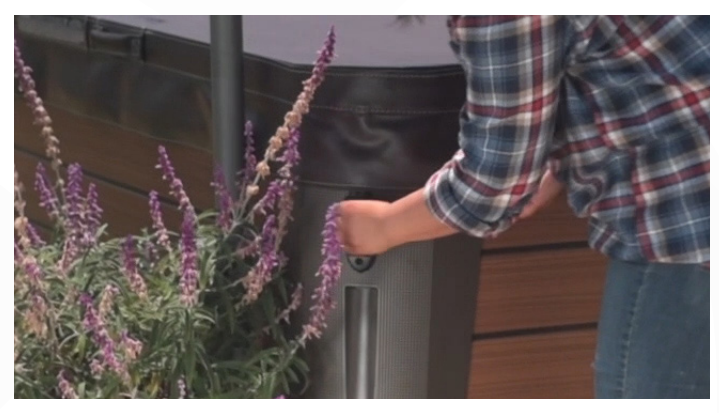
Lower the cover in place and lock the safety straps.