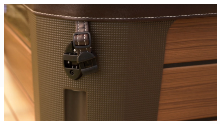
1. Unlock the spa straps.