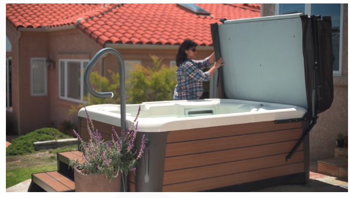
3. Fold the cover over and push it upright. The cover will automatically lock open.

Be sure to contact your local Hot Spring® dealer to order your replacement cover once you begin to see signs of wear on your spa cover.