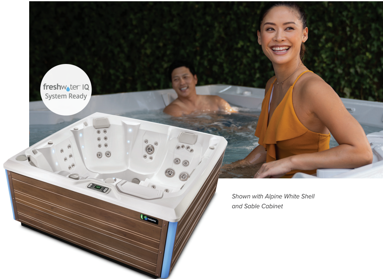
Shown with Alpine White Shell and Sable Cabinet

People Seating Jets Voltage 6 Seats Lounge 43 Jets 230 V