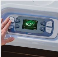
Color LCD Display